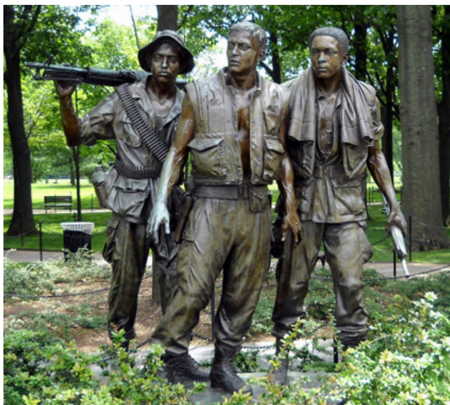
Frederick Hart, Three Soldiers , 1984 Vietnam Veterans Memorial, Washington, D.C.